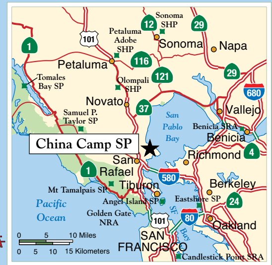
© 2009 California State Parks (Rev. 2015)