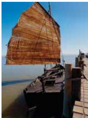
The Grace Quan

Explorer Sir Francis Drake called the Miwok “peaceful and loving” when he met them in 1579. The Miwok population declined after Mission San Francisco de Asís was established in nearby San Francisco in 1776; its sister mission, San Rafael Arcangel, was built in 1817. The mission system drastically changed the traditional lifestyle of the native people. By 1900, few were left of an estimated 2,000 Miwok just a century earlier. Today some Miwok descendants still live in the area.