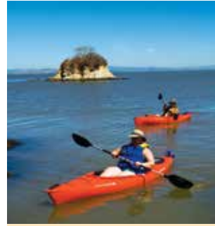
Kayaking near Rat Rock

Programs and Events —Campfire programs are held for campers from May to October. Junior Ranger programs are held by request. Heritage Day celebrates Chinese culture with activities, tours, and exhibits. The schedule is available at www.parks.ca.gov/chinacamp . School and other groups should call (415) 456-0766 in advance to arrange visits.